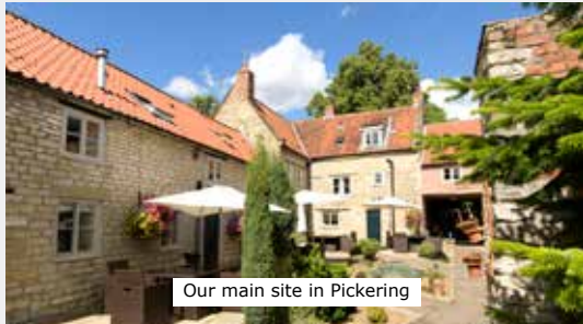
Our main site in Pickering

We are a small holiday cottage business with cottages in and around Pickering and on the North Yorkshire Moors. Our cottages are a mixture of those we own and operate ourselves and others that we act as an agency. The common link is that all the cottages have an emphasis on quality, service and a real home from home feel.