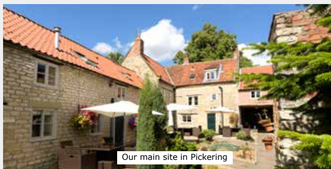
Our main site in Pickering

Pickering is a small market town and the perfect location for exploring the moors, coast and the many historic properties in the area. Fantastic for walkers, cyclists and outdoor pursuit enthusiasts as well as, steam train enthusiasts, and bird watchers.